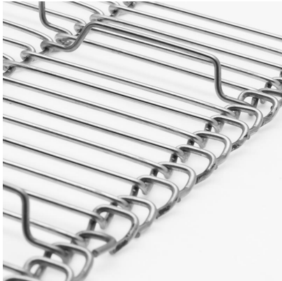
Wire mesh belt (trapezoidal elevation)